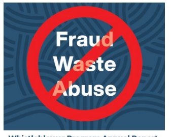
Whistleblower Program Annual Report Fiscal Year 2021-22